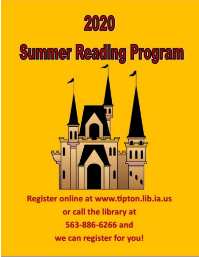
Online Summer Reading Program