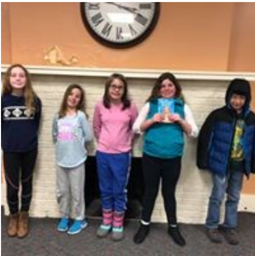
Book Chats for all ages