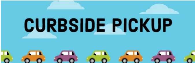
Curbside Service due to Covid-19

YOUR LIBRARY IS NOW FINE FREE No charges, no hassle when things are late!