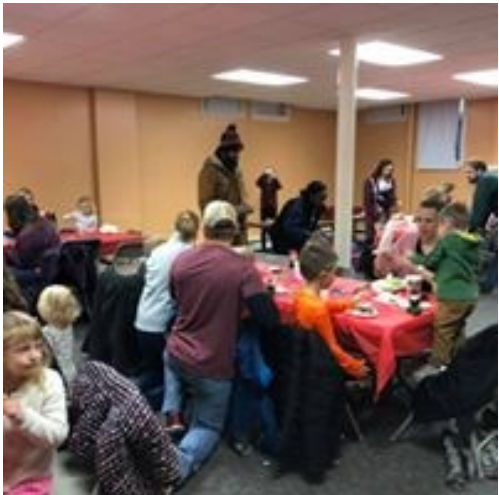
Special Story Times