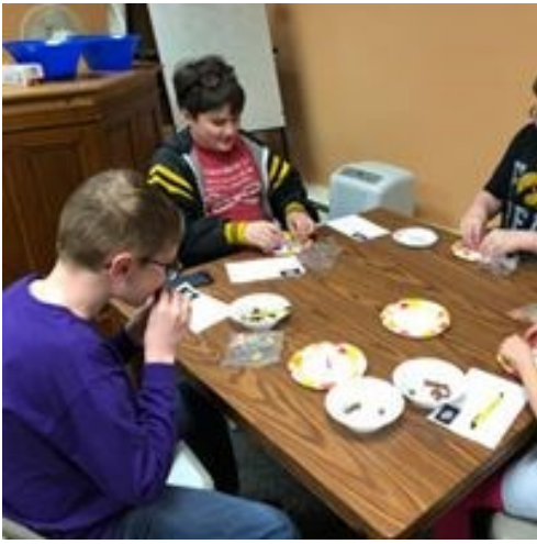
“Early out Wednesday” activities